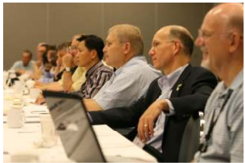
Affiliate Council in session at IAFP 2008.